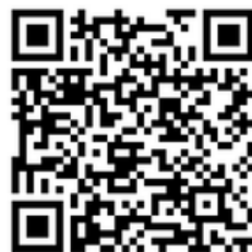
Lactation Rooms by Campus